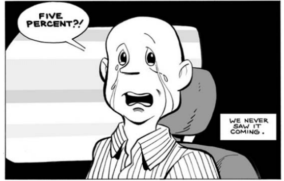
© 2006 Brian Fries. Reprinted by permission of Brian Fies.