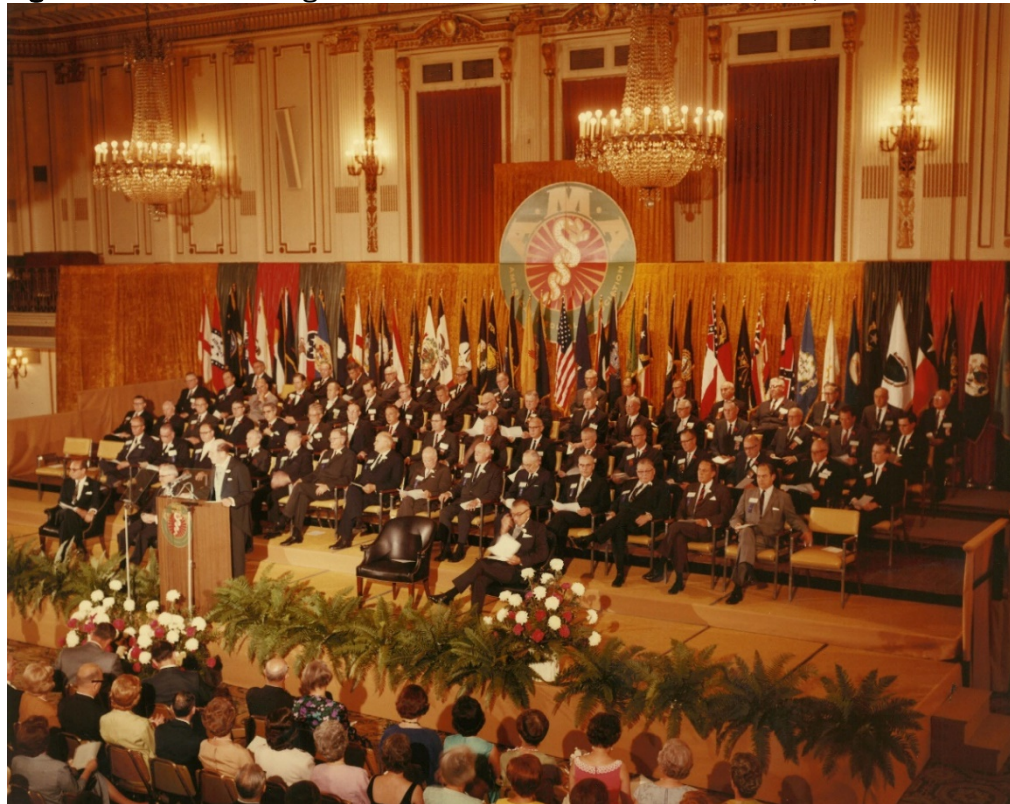
Figure 1. Annual Meeting of the American Medication Association, 1966 a

a Reprinted with permission from the American Medical Association Archives.