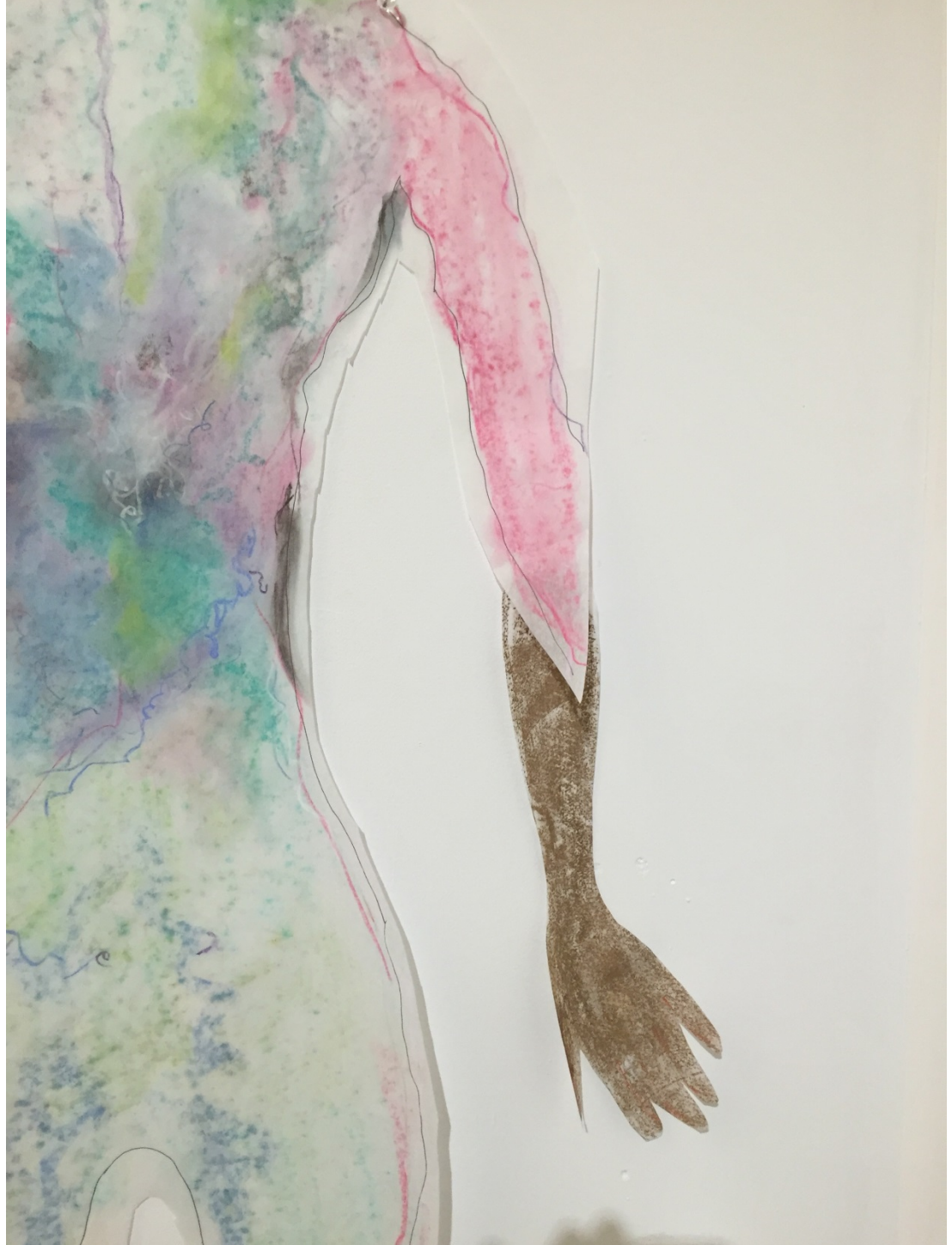
Figure 5. Detail of Interdependence , by Merel Visse