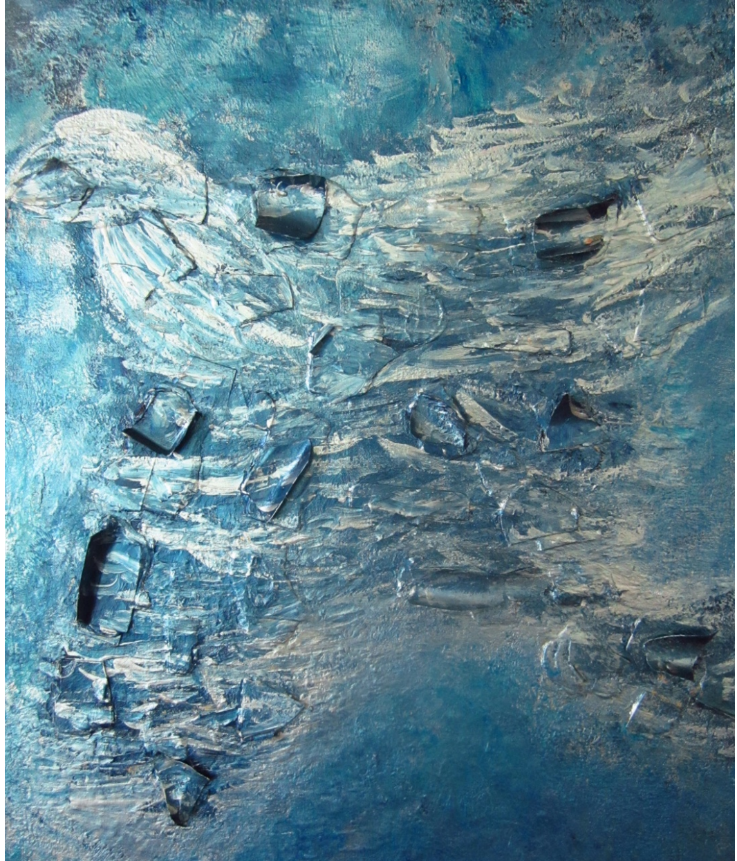
Figure 2. Detail of Universal Light, Nurture and Nursing , by Margeaux Gray