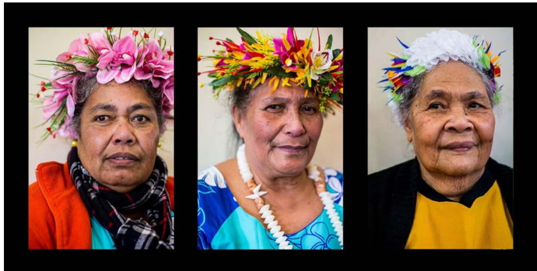
Figure 4. The Faces of Tuvaluans in Auckland.

Physician advocacy can play a significant role in supporting solutions to toxic social determinants of health and in improving health literacy in this vulnerable population. A good example is a recent campaign by New Zealand Pacific clinics—primary care clinics that specifically serve Pacific Islanders—to raise awareness about the danger of rheumatic fever [14]. Through the use of consistent, translated, and culturally appropriate messaging, a number of the Tuvaluans and clinicians interviewed by the first author reported that this campaign had changed how many Pacific Islanders viewed not only rheumatic fever but also the role of primary care more generally in promoting wellness. If accessible, the health care Tuvaluans receive in New Zealand is superior to that in Tuvalu, making not only primary care but also early detection and treatment for serious conditions like cancer and chronic kidney disease finally possible.