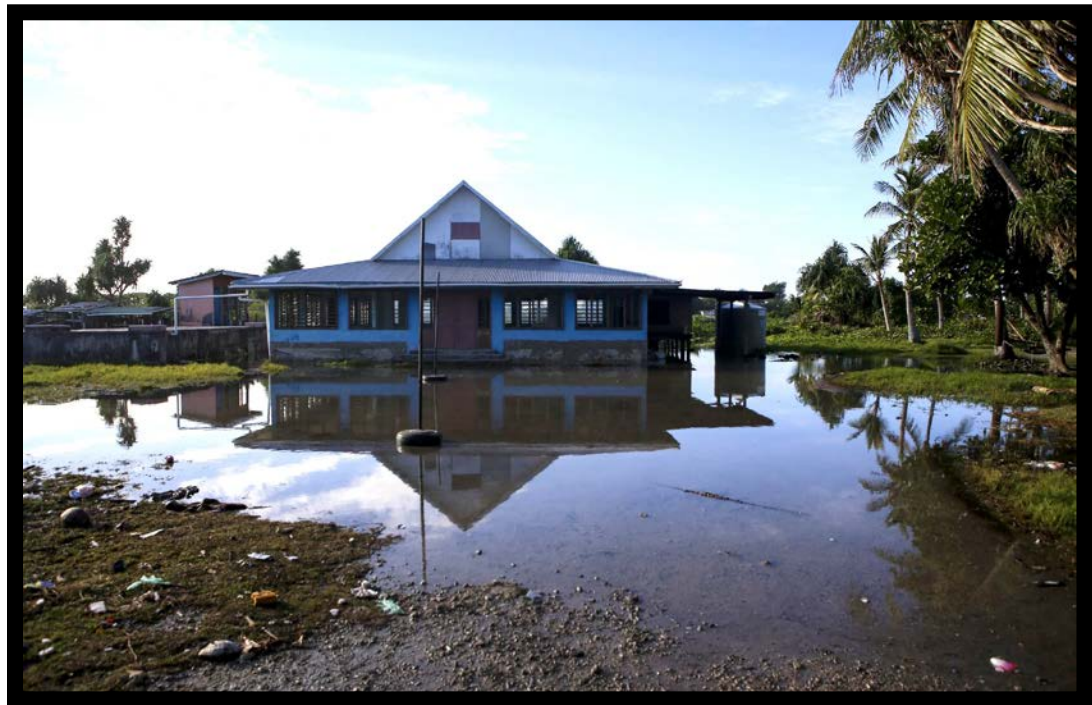
Figure 5. Tuvaluan High Tide.

The problem with Tuvalu, as with any other community faced with climate change relocation, is that it is a disaster in slow motion. The insidious nature of the effects of climate change makes it possible for life to persist on the islands for a long time before it suddenly becomes inhospitable, requiring emergent evacuation. The ethics of relocation is complex because we must account for affected persons' varying means and knowledge about effects of climate change and how these factors inform the motivation of some to leave their homeland. Although many who choose to remain in Tuvalu do so out of pride in their land and culture, some do so because they lack the money to pay for immigration or lack awareness of the fact that the sea will overtake the island. While