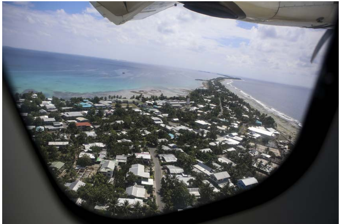
Figure 2. Funafuti from the Air.

Tuvalu is an island nation in the South Pacific of roughly 11,000 people divided into nine atolls [4], united by their ethnicity and language but each with their own distinct cultures and traditions. With the highest point around 16 feet above sea level [4], Tuvalu is eroding away under a rising ocean [5, 6].