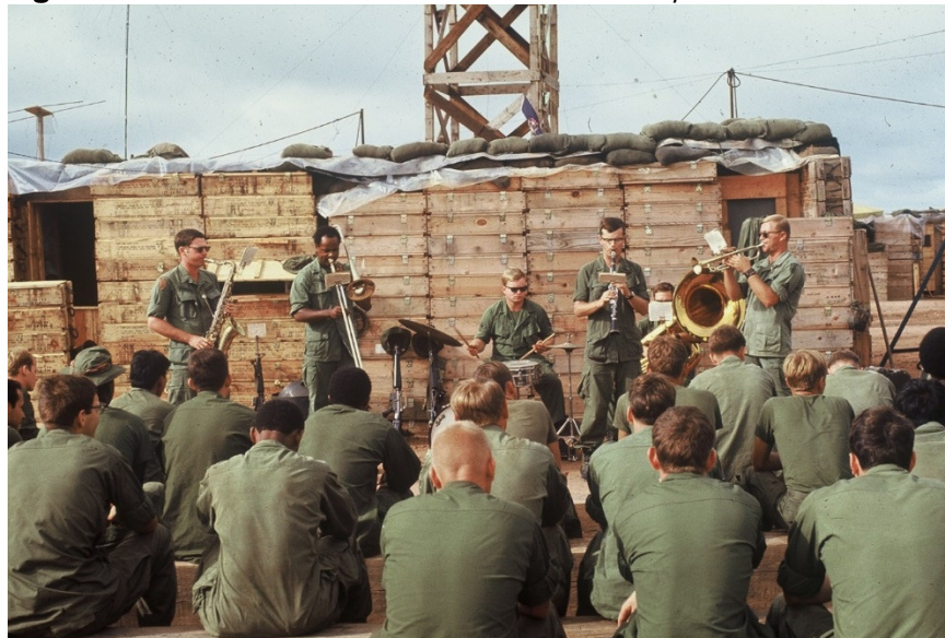
Figure 3. US Soldiers in Vietnam Listen to an Army Band