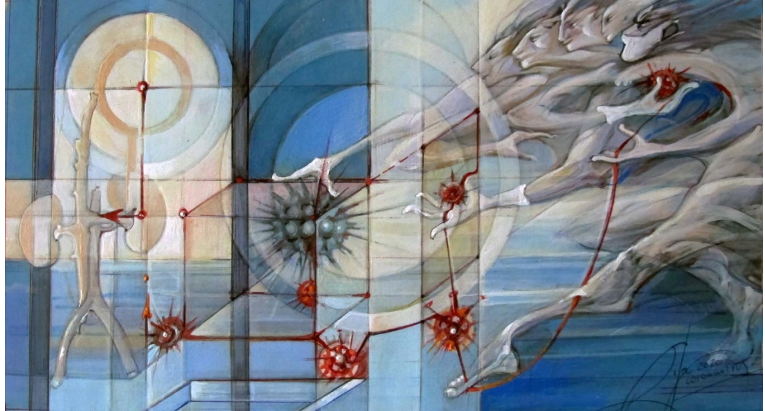
Figure 1. The Threat , 2020, by Francisca Lita Sáez

In The Threat , figures at right respond to attack by the SARS-CoV-2 virus at center. Like the Furies from Greco-Roman mythology—and like clinicians—these figures try to protect the cosmos from chaos and infection.