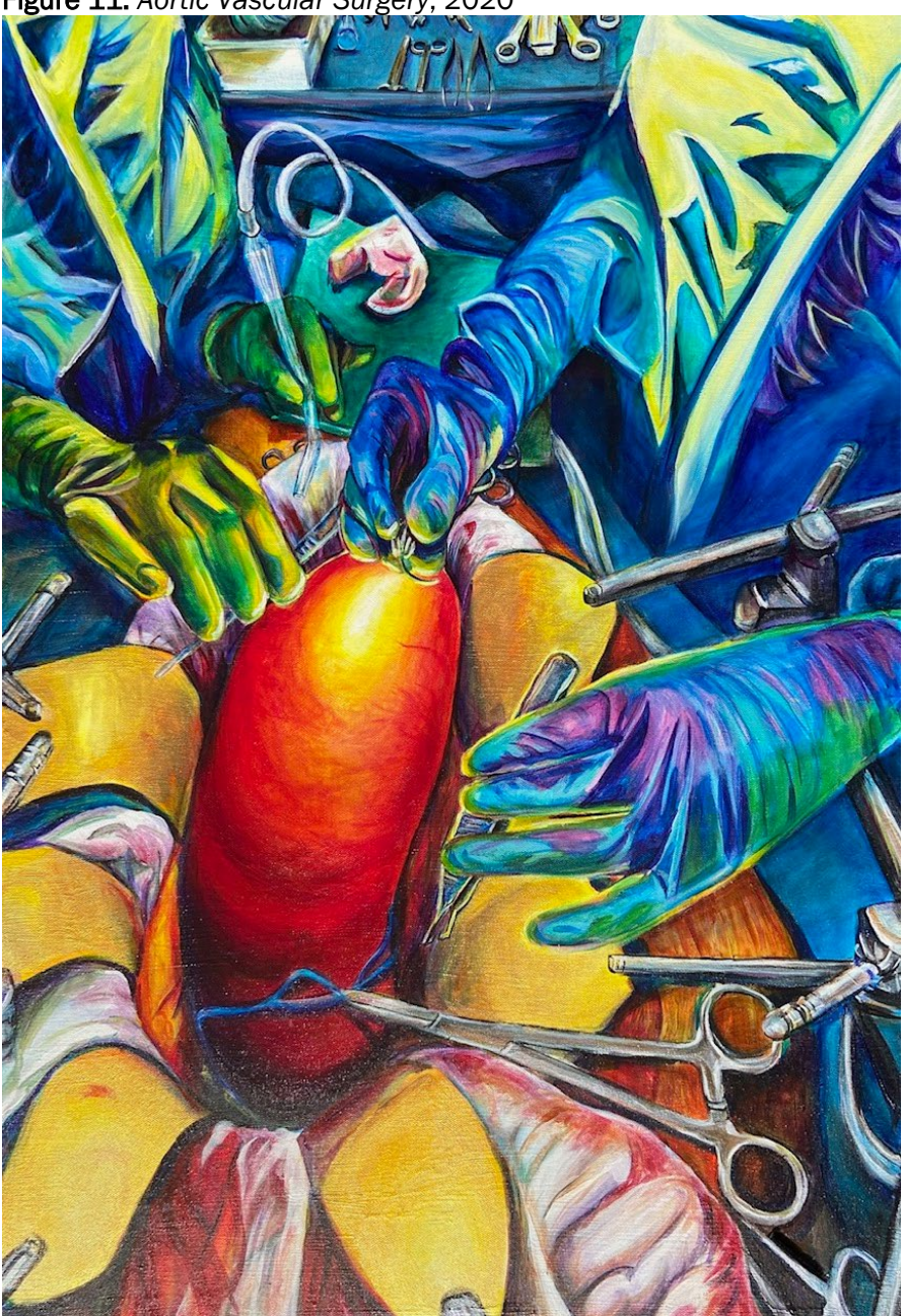
Figure 11. Aortic Vascular Surgery, 2020