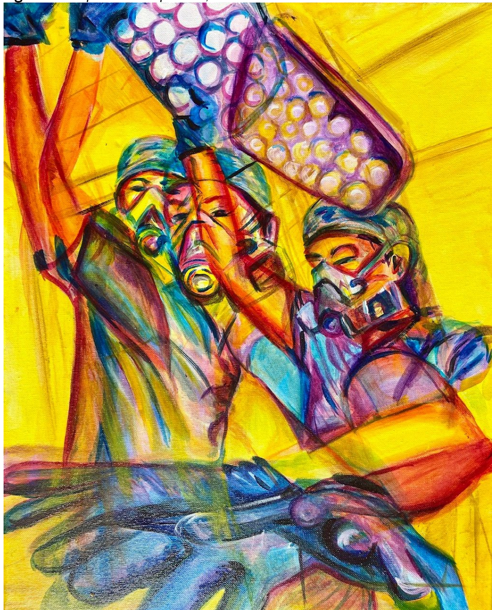
Figure 3. Respirator Perspective, 2020

to contain the virus. Beyond the skin layer, we are all the same, so I layered saturated yellow, cerulean blues, and magenta to create a multidimensional pallet.