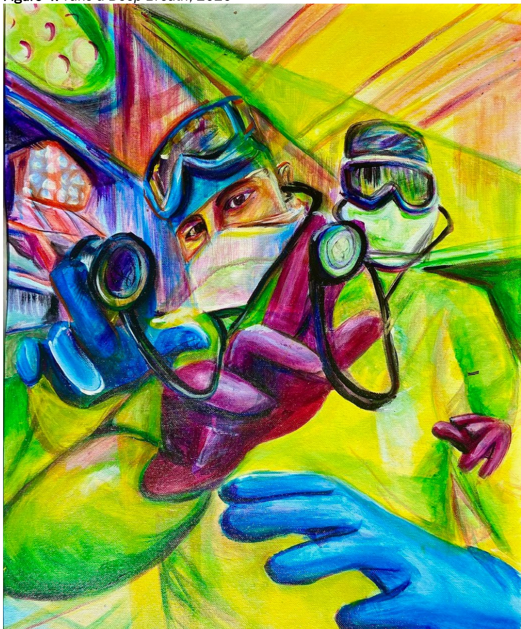
Figure 4. Take a Deep Breath, 2020

online at triple the normal price, we cold-called the nearest hardware stores every morning to occasionally get a lead about acquiring reusable respirators for members of the team. We wear single-use masks for 12 hours.