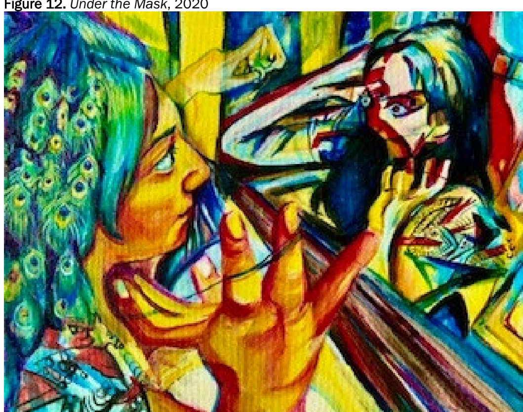
Figure 12. Under the Mask, 2020