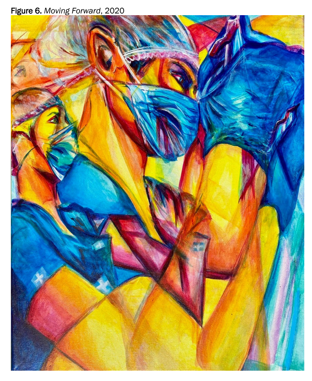
Media Acrylic on canvas, 16" x 20"