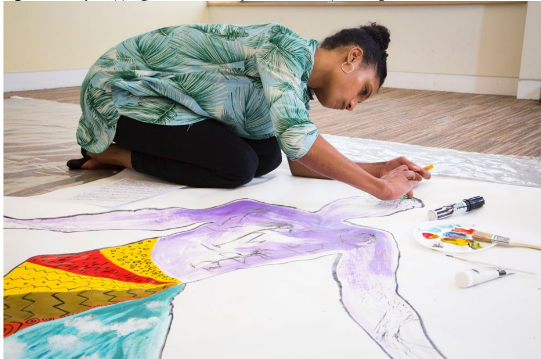
Figure 2. Body Mapping Creative Activity in a Workshop Setting

Reproduced with permission of GOSH Arts from Layton S, Biglino G. 14 © 2018 GOSH Arts. The pictured participant consented to being photographed.