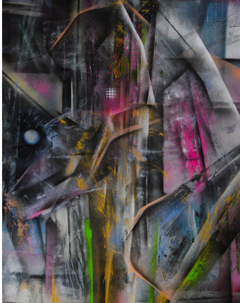
Figure 3. The First Tonal Imprint

Wires suggest sound waves resonating, as if from a musical instrument, to transcend their physical origins. Pastel and dusky colors might evoke a viewer's sense of familiarity with hues of everyday life. Markings on the canvas, akin to whispers, symbolize the broader connections wires serve to forge between illness and healing.