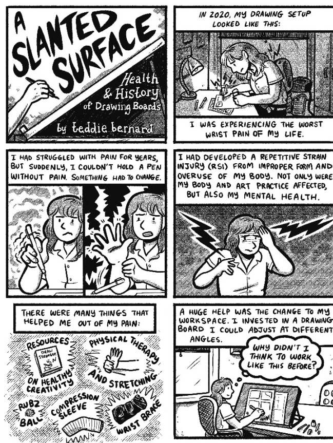
Figure. A Slanted Surface—Health & History of Drawing Boards

Angled work surfaces—drawing boards, drafting tables, and writing slopes—have been used by artists for centuries. These innovations have long helped comic artists preserve their bodies' capacity to create. This comic describes one artist's overcoming of repetitive strain and injury and traces a history of earlier comic artists' strivings to align their creative practices with their bodies' needs.