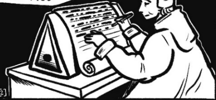
Jean Mielot MEDIEVAL SCRIBE CIRCA 1460

WRITING SLOPES HAVE A MORE GENTLE ANGLE AND ARE PRIMARILY USED FOR TEXT.