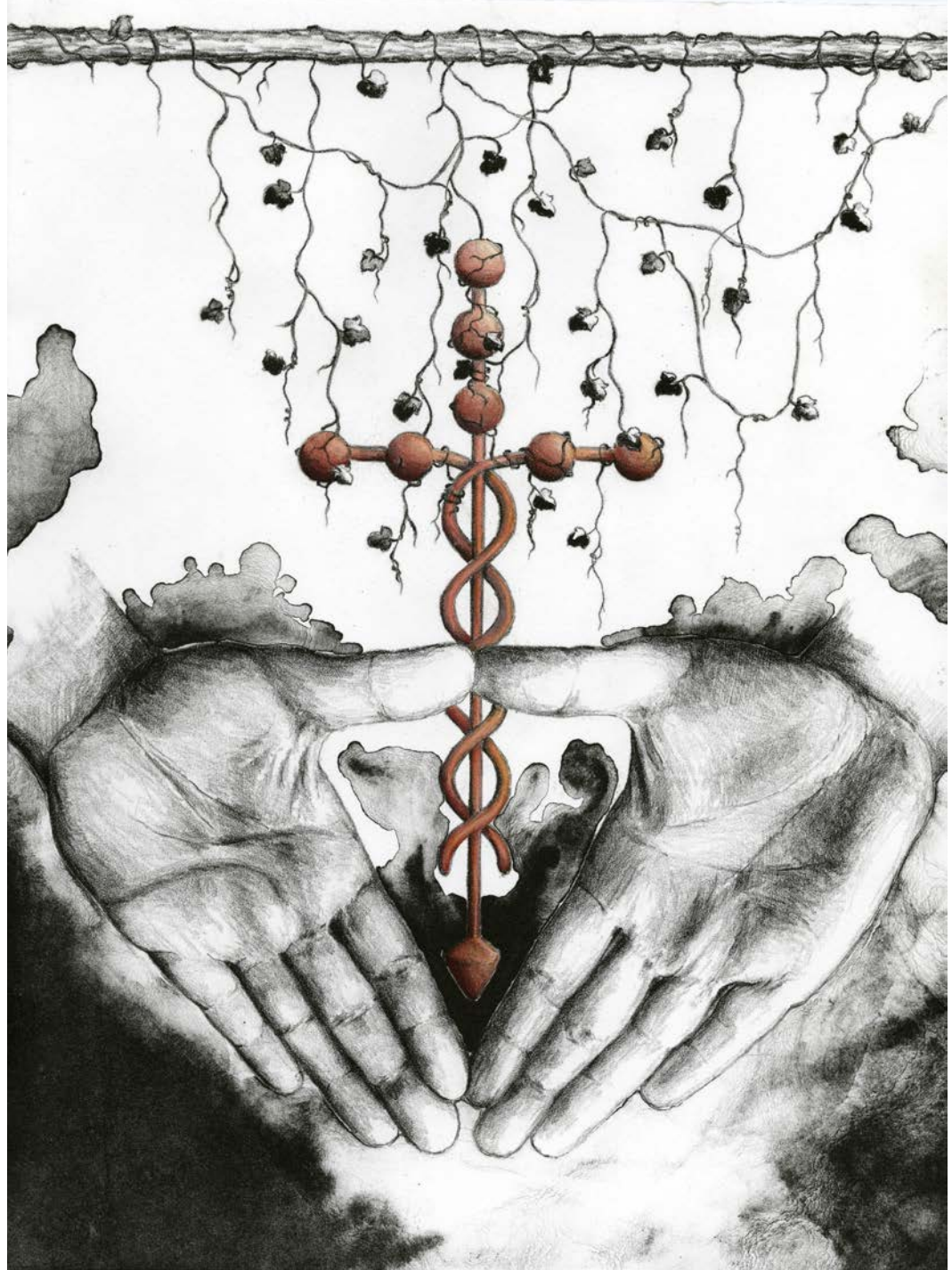
Figure 1. Tripp Leavitt, Le Pendu , 2010, lithograph and watercolor on paper, 11 x 15