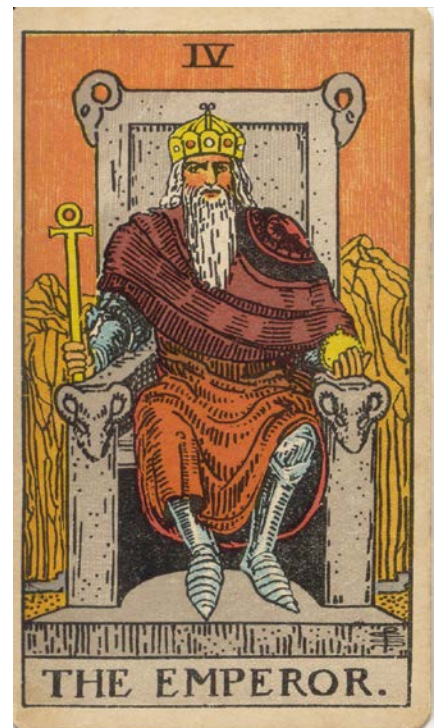
Figure 3. The Emperor tarot card

The Emperor is interpreted as a figure of authority, power, and discipline. His granite throne—sometimes understood as a kind of intellectual throne—emphasizes his fixed state, and he is the embodiment of law and rationality, knowledge, and consciousness. As the Hanged Man is connected to The Emperor, the fates of medical students, too, are connected to those of their mentors. Unlike students in many other graduate educational programs, medical students for the most part do not pave their own paths to discovery. Instead, we rely significantly on others to teach us. We must follow the guidance of our superiors, for they have the knowledge and experience that can transform us into effective clinicians. The aspect of apprenticeship in medical education has been one of medicine's greatest draws in my own choice of career. However, this apprenticeship also feeds into the rigid hierarchy that has become the accepted order in the health care setting.