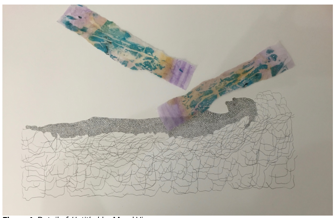
Figure 1. Detail of Untitled , by Merel Visse

This project presents research-based art works that inquire into the tensions in everyday life from an ethical viewpoint of care, which sees people as embedded, "nested" in care-based relationships. Trust is the glue that holds these "nests" together. Care is the air that lifts them up, but tensions exist as well—between dependency and autonomy, vulnerability and strength, for example. The pull of these ideas exist in a kind of "check" and run through our relations and being.