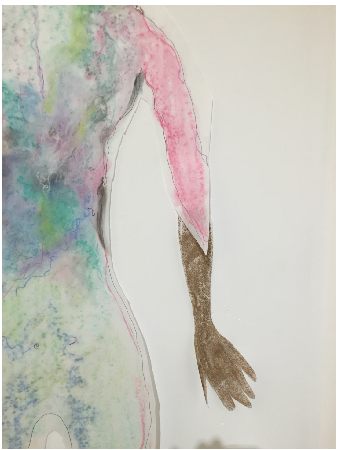
Figure 5. Detail of Interdependence , by Merel Visse

This wall object (ink and pastel on transparent paper) explores our dependence—a function of our bodily fragility—and our interdependence. It illustrates how my husband and I—him being black, me being white—are interdependent and how that interdependence constitutes my body and well-being. Care ethicists often speak about