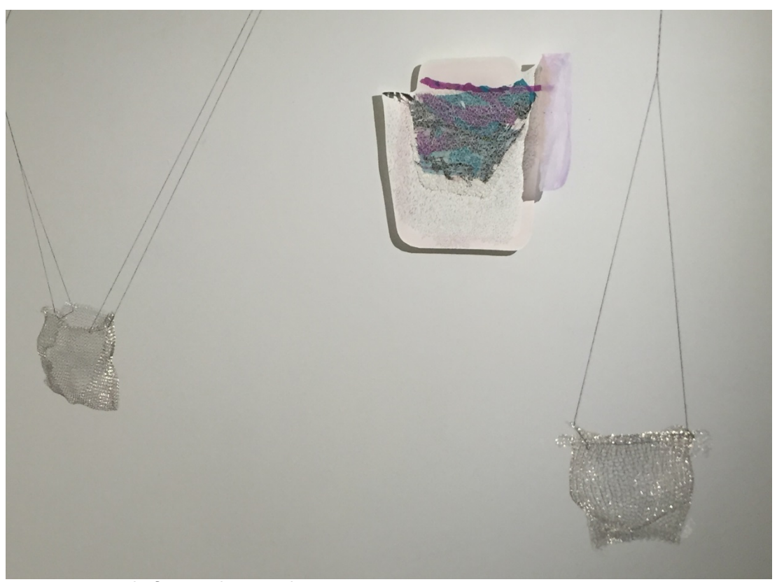
Figure 4. Detail of Nests , by Merel Visse

Nests is a three-dimensional installation that consists of several objects (nests) made of mixed materials (ink, textiles, and watercolor on paper, thread, and metal). The nest can be a symbol of the isolation and seclusion of health care experiences, on the one hand, and a symbol of connection and community, on the other.