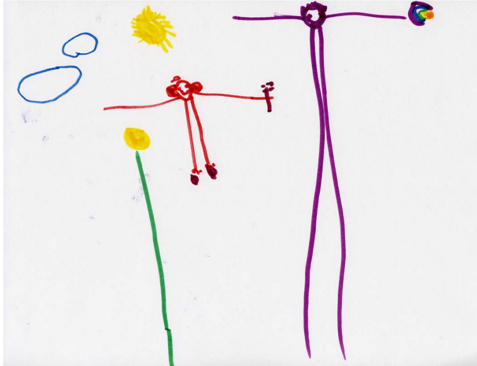
First drawing, by Sierra: Ella in heaven giving flowers to God next to a rainbow, with the sun and clouds in the sky and a big yellow and green flower. Ella has wings and a halo and is wearing slippers!