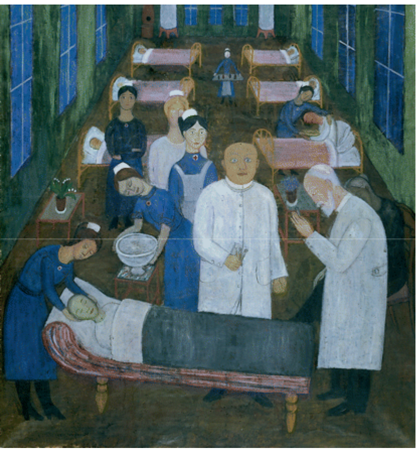
Figure C. Hilding Linnqvist Hospital Ward II 1920 Moderna Museet, Stockholm

Figure C presents a more formally composed, haunting style and atmosphere when compared with the warmth of the previous image. It appears that the condition of the patient in this painting is more serious. Once again, the doctors in white are presiding over the scene while the nurses, in blue dress, are actually touching the patient, in both the fore- and background. Nurses' and physicians' garb is starkly differentiated and immediately identifiable, while their roles within the context of the work seem to be delineated such that doctors ruminate over care that nurses subsequently deliver. The closeness of nurses to the patients in all three of these images helps to illustrate how caregivers may be subject to hierarchical inequity in their professional relations.